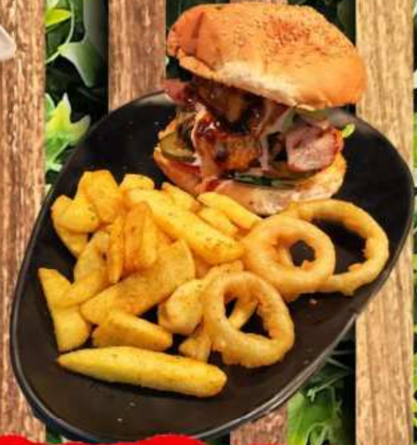
BACON & AVO BURGER