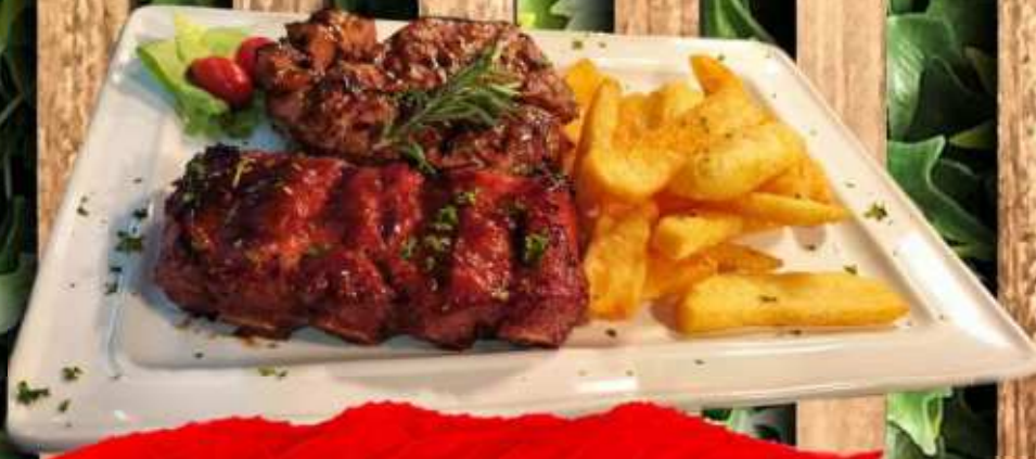
RUMP AND RIBS