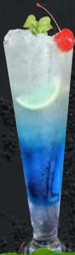
CALIFORNIA ICE TEA