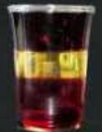
LOCH NESS MONSTER