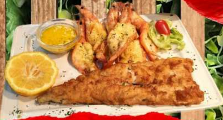
HAKE AND PRAWNS