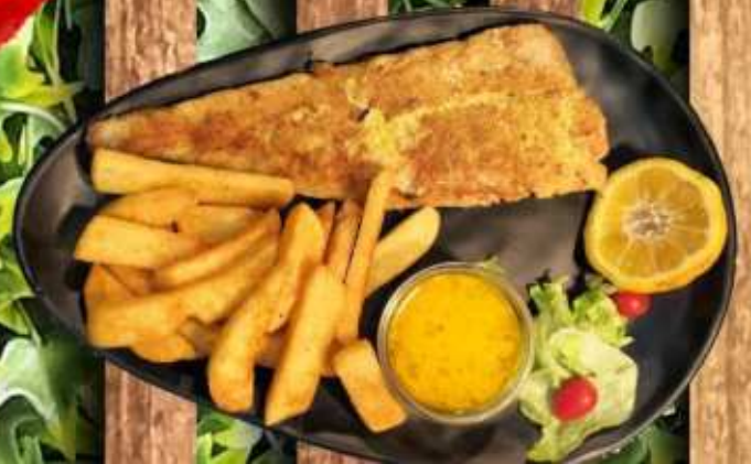
HAKE AND CHIPS